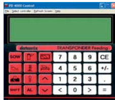
Datamix Transponder ESF