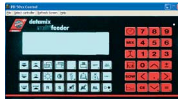
Datamix Multifeeder 5010