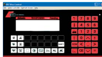
Datamix Transponder ESF (super)